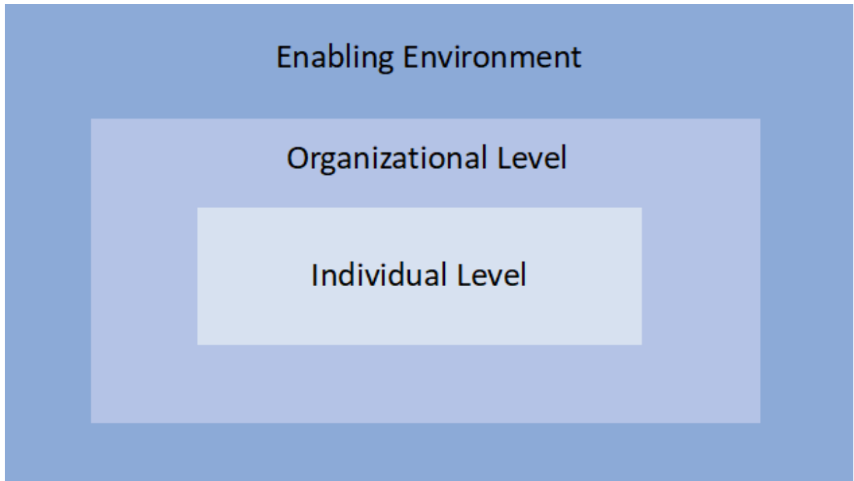
Figure 1 – Three levels of capacity.

Capacity development needs to occur at all three levels to create success, as the different levels are interdependent on each other as shown in Figure 1.