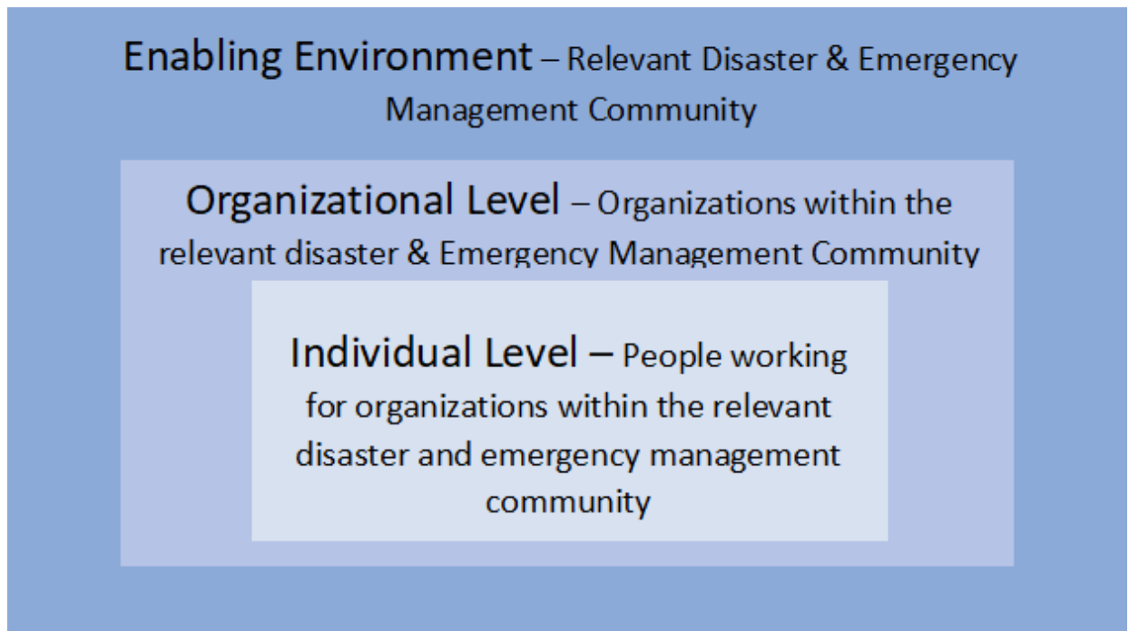
Figure 2 – Three levels of capacity adapted for the disaster community.

Using the model described in Clause 3 as the foundation, it can be overlaid with the disaster and emergency management ecosystem, which looks like the following.