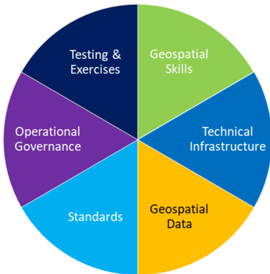
Figure 4 – Six capacity elements.

All these six elements must be underpinned by data-sharing principles and trust if geospatial readiness is to be achieved. Historically, geospatial information has been collected, managed, and stored in silos. Cross-organization, sometimes even inter-organization, data sharing has been difficult, and often limited by various technical and governance factors. For a strong geospatial disaster response, data need to be collected, shared, exchanged, analyzed, and visualized across the community of responder organizations, field responders, and citizens affected.